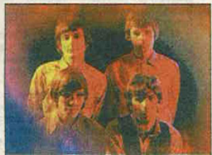
Psychedelic . . . starting out in 1967