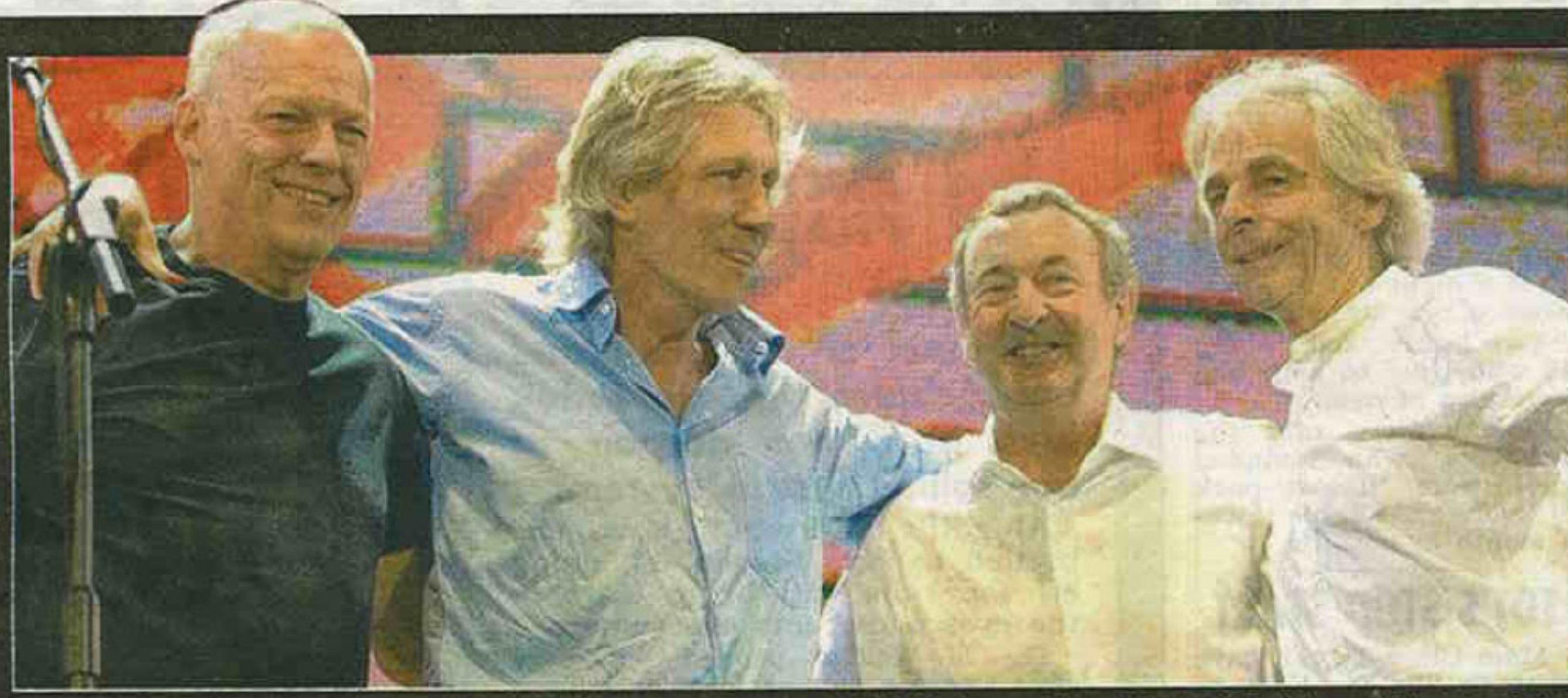
In the Pink . . . from left, Gilmour, Waters, Mason and Wright at Live 8 in 2005. Moon album, right