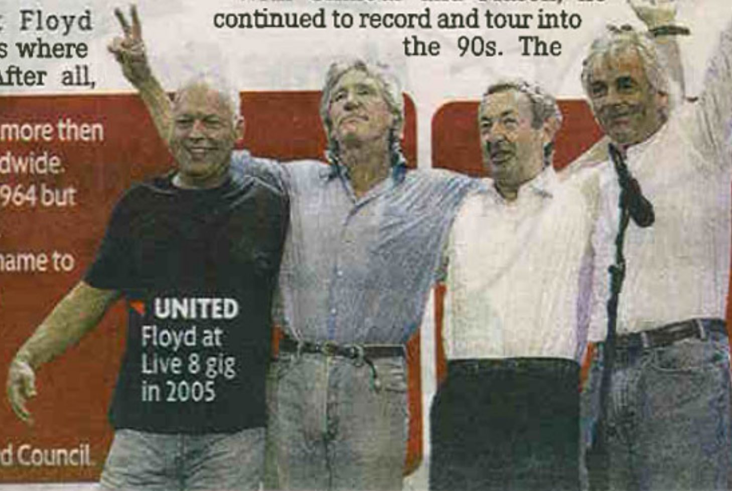
▶ UNITED Floyd at Live 8 gig in 2005