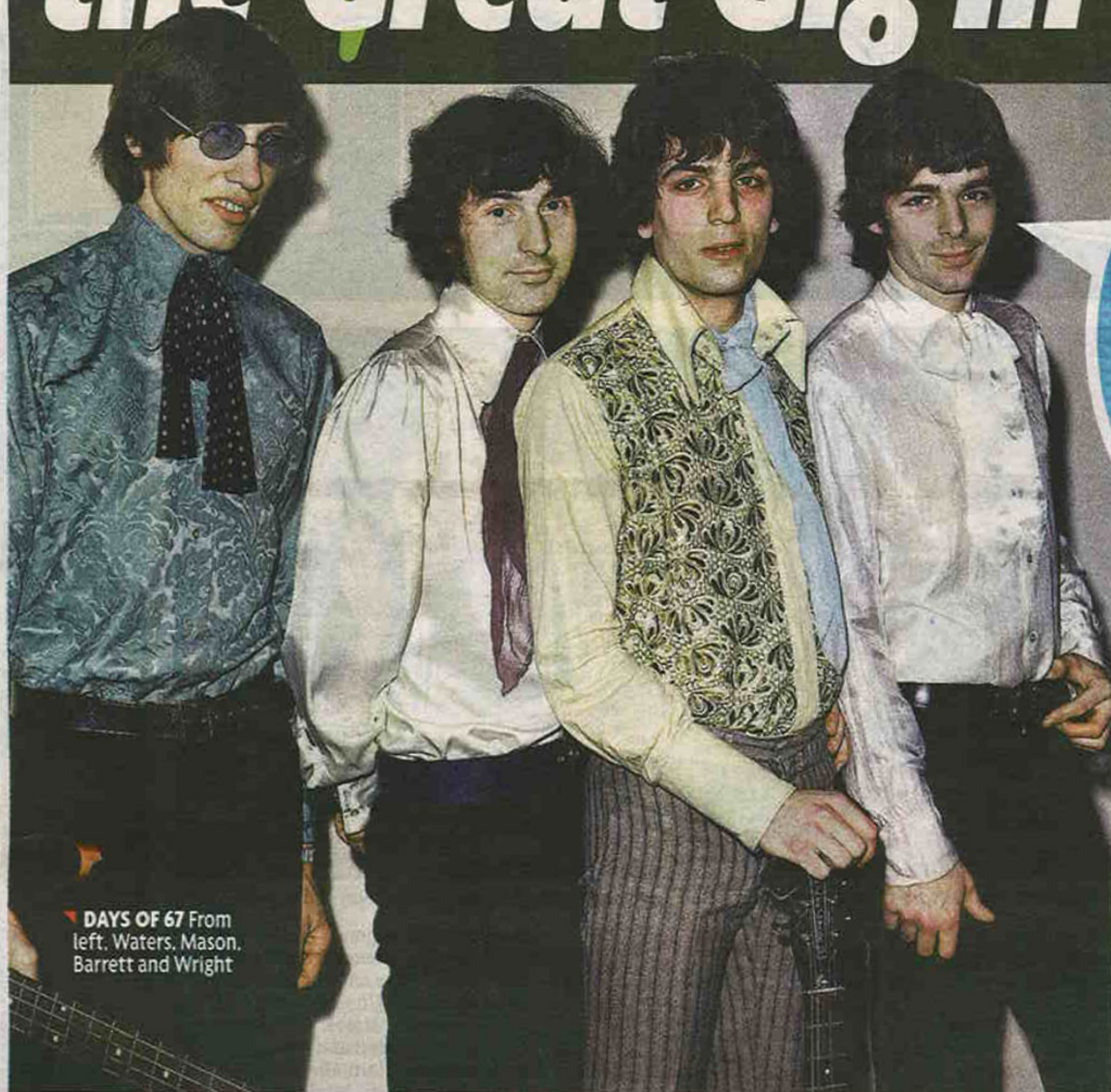
▶ DAYS OF 67 From left, Waters, Mason, Barrett and Wright