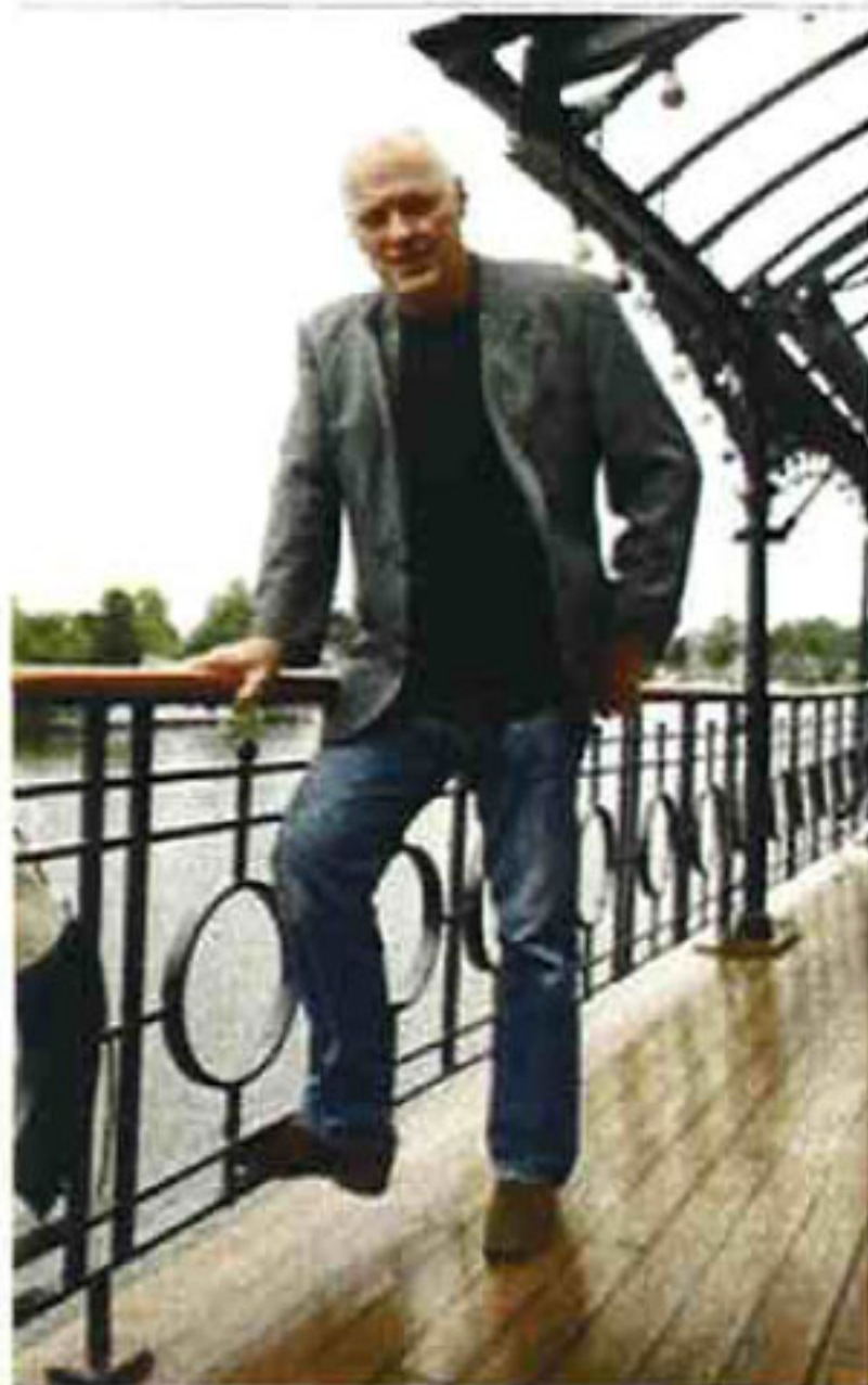
Former British Pink Floyd band member David Gilmour poses aboard his studio boat the "Astoria" on the River Thames in London, on Wednesday, Aug. 13, 2008.